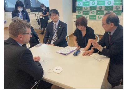
Meeting with national government representatives (June 2022, Vienna)